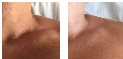
Before After