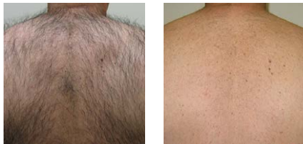
Before After