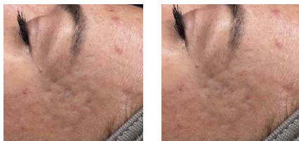
Before After