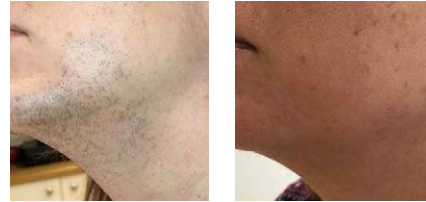
Before After