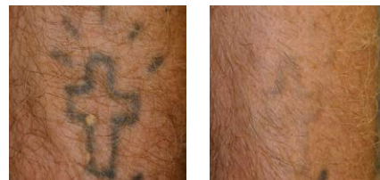
Before After