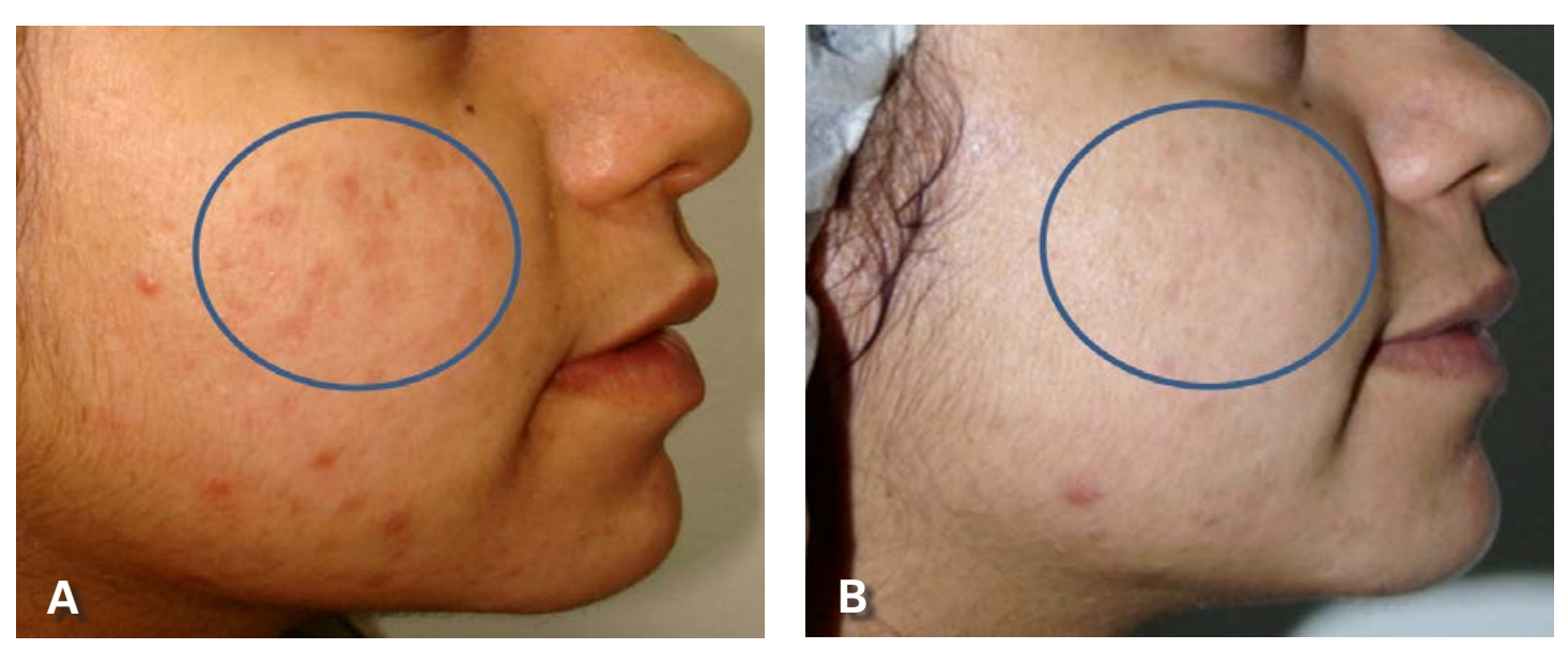
Figure 4. Case 1 before ( A ) and after three sessions ( B ) of CO<sub>2</sub> fractional laser and simultaneous radiofrequency for atrophic acne scars on the cheeks and forehead.

Each patient was assessed monthly during the treatment period, and then 3 months after the last laser session. All the information provided by each patient in the medical record was collected, and an objective evaluation of the photographic material, and the pictures before and after treatment were compared. Overall, an improvement of the treated area was found, defined by the patients as significant. In terms of the photographic objective control, improvements to skin texture, homogenization of skin tone and a decrease in the depth of the atrophic scars were noted, estimated by the evaluator as an improvement of 60-70%. See figures 4, 5 and 6. As for the adverse effects, no moderate or severe side effects were reported, the