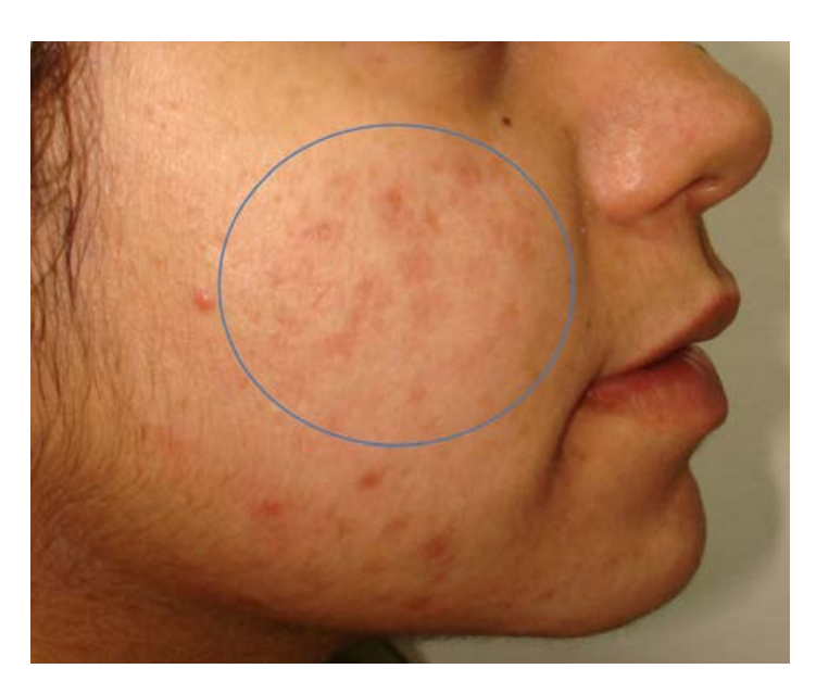
Figure 1. Case 1 patient before any laser treatment.

A 27-year-old woman, with no medical history of importance, presented to the medical appointment aiming to improve her acne scars. On physical examination, the patient was a Fitzpatrick skin phototype IV, with generalized facial dyschromia secondary to multiple post-inflammatory hyperpigmentation macules. In addition, there were multiple rolling and icepick atrophic scars located on the cheeks and forehead. No inflammatory and non-inflammatory acne lesions were noted (figure 1).