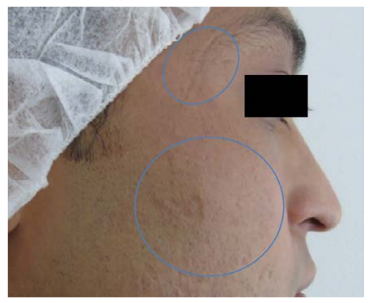
Figure 3. Case 3 patient before any laser treatment.

An otherwise healthy 26-year-old man sought medical help for multiple atrophic acne and traumatic scars on his face. On physical examination, the patient was a Fitzpatrick skin phototype IV, with facial dyschromia, linear atrophic scars on the right periorbital area, and several boxcar and rolling atrophic scars on the cheeks. No inflammatory and non-inflammatory acne lesions were noted (figure 3).