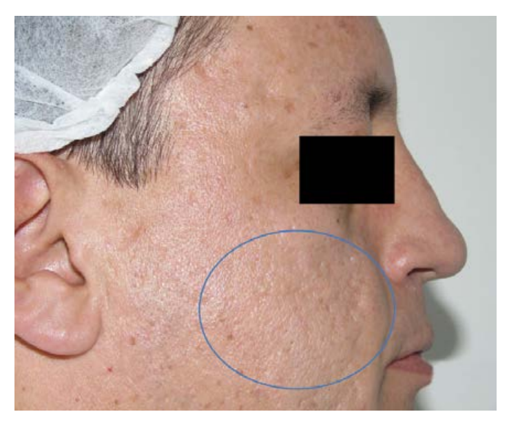
Figure 2. Case 2 patient before any laser treatment.

face, as well as on the submental skin. No inflammatory and non-inflammatory acne lesions were noted (figure 2).