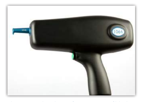
The 1064nm handpiece for treatment of black & dark blue ink pigments