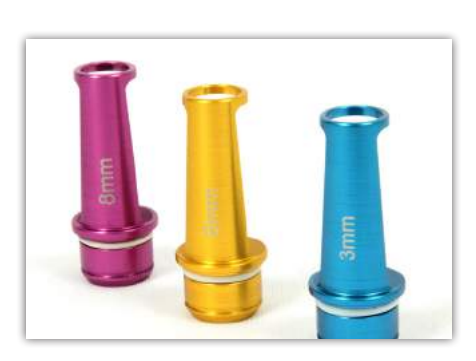
LUMINETTE Q interchangeable laser spot sizes

Cost-effective passive tattoo removal laser with an unrivalled clearance of tattoos, together with award-winning post-purchase support & service