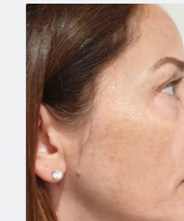
Pigmentation